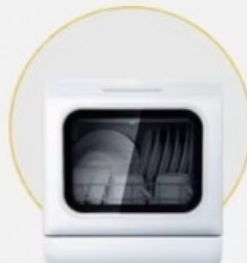
Desktop DESK TYPE