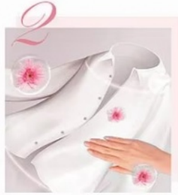
Friction fragrance (the fragrance essence releases the fragrance as the clothes swing)