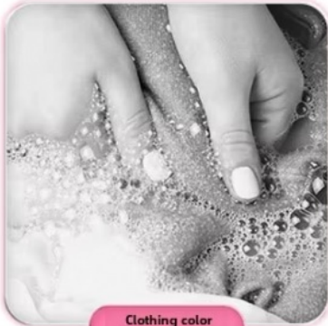
Clothing color transfer

Precisely decomposes more than 10 stains and deeply penetrates clothing fibers. slot residual dirt molecule surface active ingredients can deeply remove stubborn stains