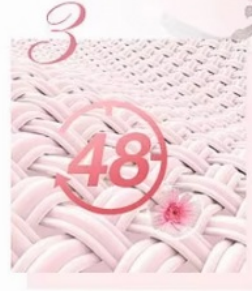
One laundry lasts for two days