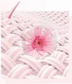
Microcapsule incense locking technology (lock in fragrance essence)

Innovative black technology lasts 48 hours ™