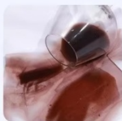
Red wine stains