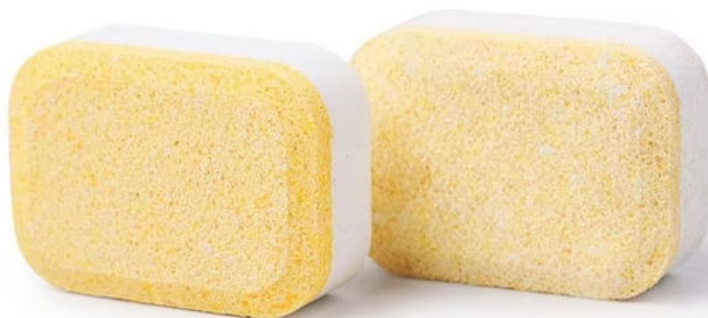
Dishwasher Special Dishwasher Block