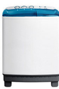
Double-cylinder washing machine