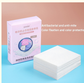
Antibacterial and anti-mite Color fixation and color protection